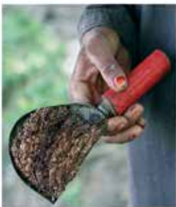
OPIUM BEING COLLECTED ON THE NUSHTAR