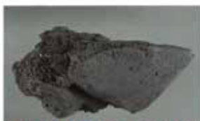
BLACK TAR HEROIN MEXICO