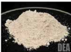
PURE HEROIN - S W ASIA