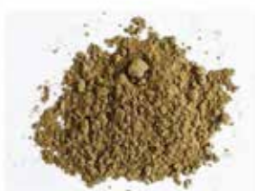
BROWN SUGER - INDIA